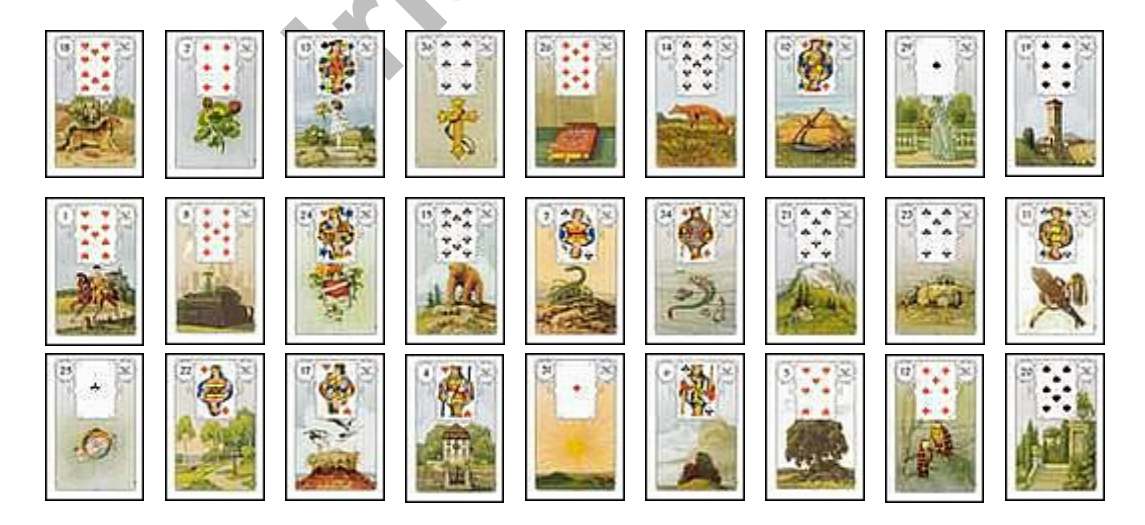
Possibly a court hearing is taking awhile (Tree) to come to a conclusion, because Tower – Birch – Park represents an public conflict with the authorities. That could just as well be the cause of the stress (Owls).