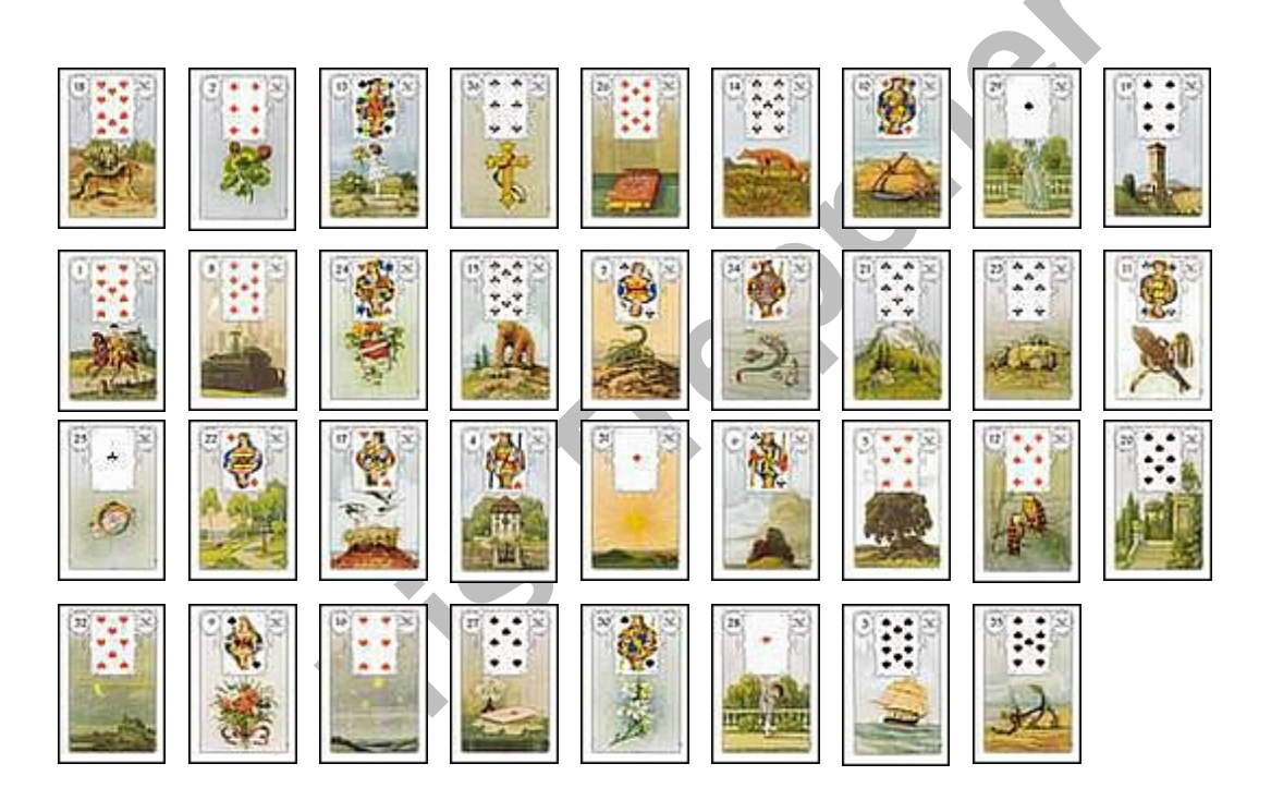
Yes, the man (Lord) is taking a business trip (Ship – Anchor)

The man (Lord), who is having an affair with this woman (The Serpent) and has feelings (Sun) for her, could be from far away or about to take a trip (Ship). However, the man (Lord) is unsure (Clouds) of how his lover feels about him.