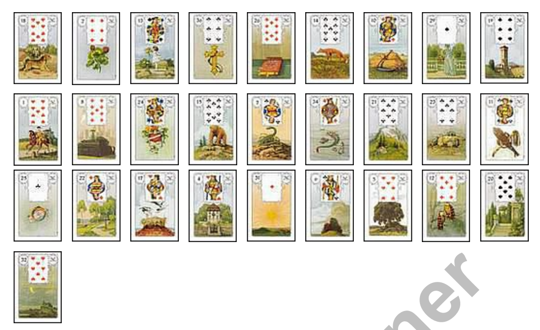
Rows 1, 2, 3, and 4 aka The Development of the Big Picture

Let's start on the right side again and try to compliment the formation. The man (Dog), who is actually unhappy (Clover – Coffin) and has received a disappointing message (Coffin – Horseman) from a young lady (Child), gets a contract (Horseman – Ring), which is successful or emotional (Moon). He's going to have to make a decision about something, because The Paths come next.