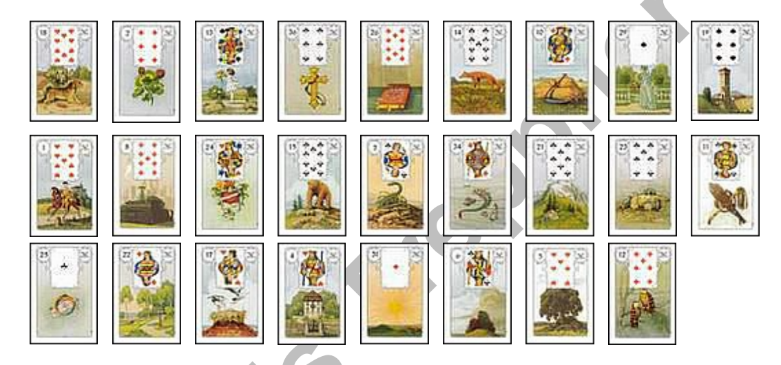
Something is still waiting to be resolved, is sick or healthy and is causing stress (Owls)