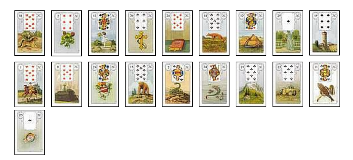
Rows 1, 2, and 3

Here, we learn that the unhappy man has gotten a contract (Horseman – Ring) – at least for now. Let's wait and see what happens.