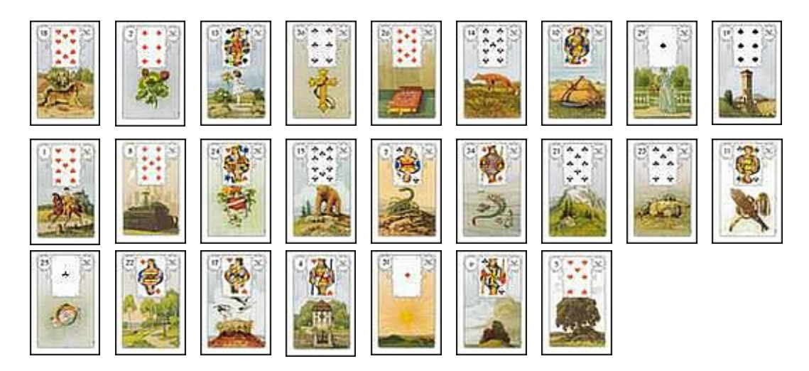
There's something else that needs to be resolved and is sick or healthy (Tree) – we'll find out eventually.