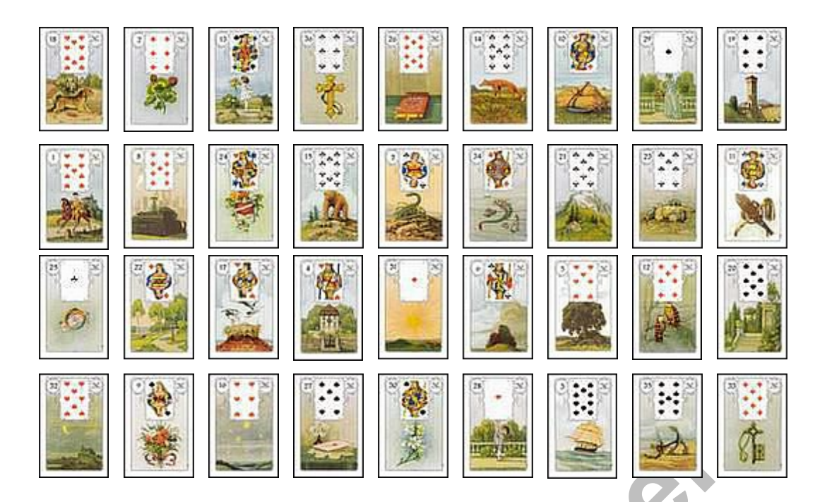
it is certain (Key) that the man (Lord) is going to have a successful (Key) business trip (Ship – Anchor)